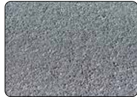
Grade 2 - Medium

A medium surface particularly applicable to heavier and more viscous accumulations. This is the all-purpose surface.