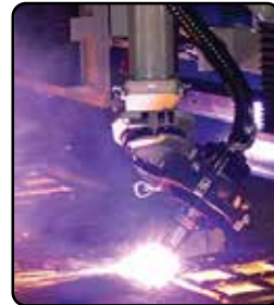
Our HPR 400 plasma cutting machine with bevel cutting capabilities.

Our advanced plasma cutting machine, with five axis bevel capabilities is capable of cutting 2" thick carbon plate with less than 1 degree bevel.