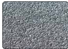
Grade 3 - Coarse

A coarse surface applicable for extremely heavy traffic and higher debris accumulation and high viscosity fluids