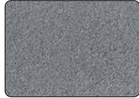
Grade 1 - Fine

A fine surface with minimum surface depth variation for comfort where pedestrian traffic flow is not directional only, but requires a lot of turning and reversing and is subject to only moderate thin liquid accumulation