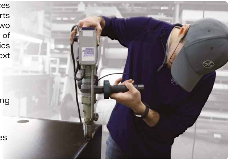
Pictured, a modified extrusion welder being used to weld a custom container

Alro Plastics has invested the time and resources to be a quality supplier of welded plastic parts and displays. From the simple welding of two sheets together to the complex assembly of custom fabricated, large containers, Alro Plastics has you covered. Please keep us in mind the next time you have a welding opportunity.