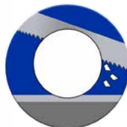
Band Saw Cutting Rounds up to 18" dia.