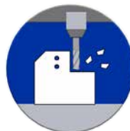
Milling Pieces up to 6" thick