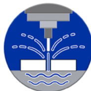
Waterjet Sheets up to 10" thick