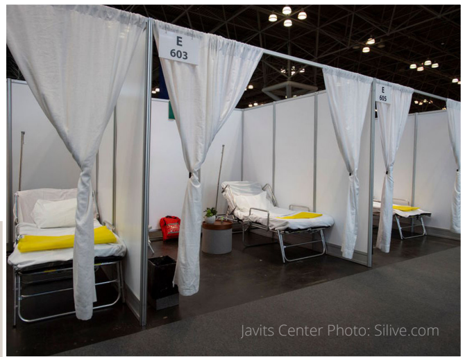
Javits Center

King StarLite ® XL Colors: Utility Black, Utility Gray, Utility White