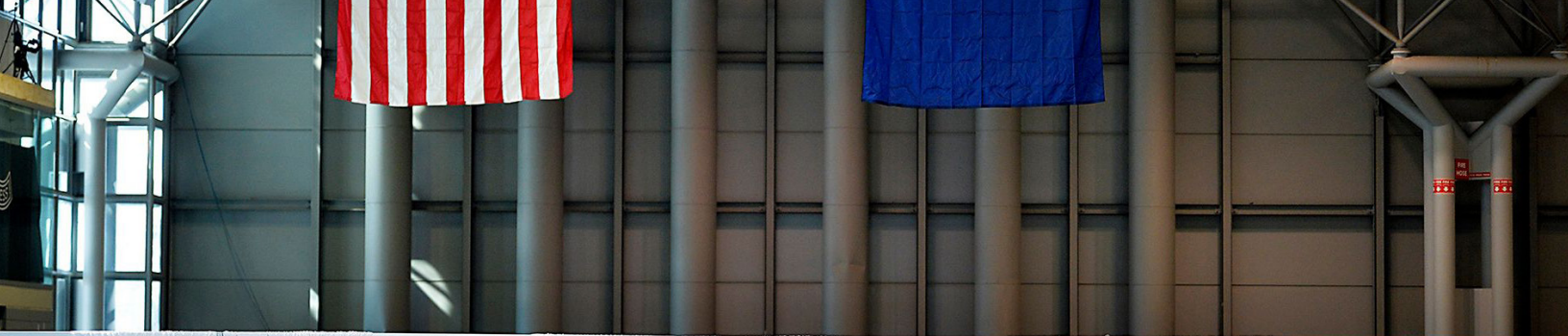
Javits Center